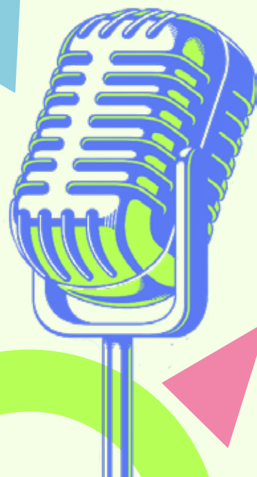
Youth Ki Baat Playlist:

What started as a virtual initiative has now grown into a hybrid model, blending online and in-person recordings. Youth Ki Baat continues to evolve, serving as a dynamic platform that bridges digital and real-world spaces. By amplifying the voices of India's resilient youth, the podcast inspires positive change and celebrates their "Stories of Strength."