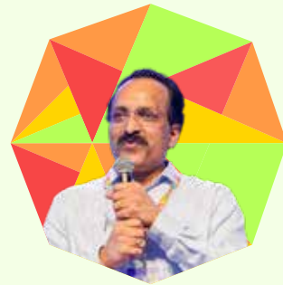
Dr. S. Somanath 10 th Chairman, ISRO