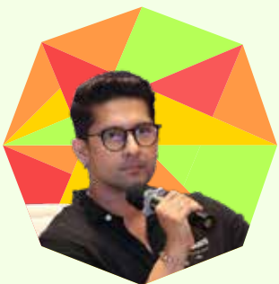
Ravi Dubey Indian Actor & Producer, Motivational Speaker