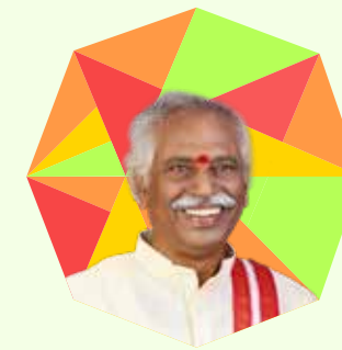
Shri Bandaru Dattatreya Hon. Governor, Himachal Pradesh