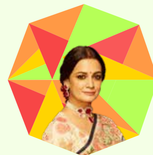
Dia Mirza Rekhi Indian Actress