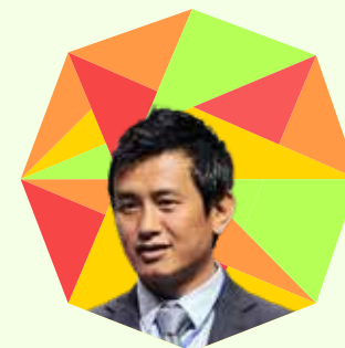
Bhaichung Bhutia Indian Football Captain