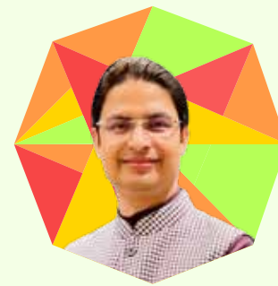
Sh. Raju Bista Hon. Member of Parliament, Darjeeling