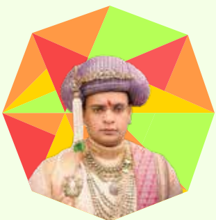
Sh. Yaduveer Krishnadatta Chamaraja Wadiyar Hon. Member of Parliament, Mysore