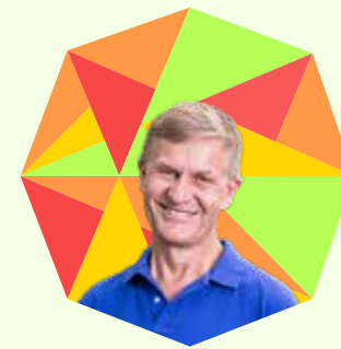
Erik Solheim 6 th Executive Director, United Nations Environment Programme