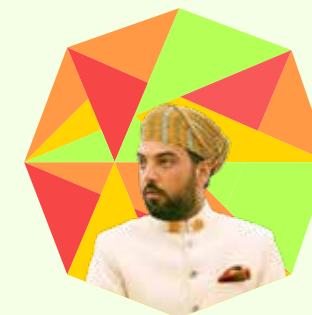
Dr. Lakshyaraj Singh Mewar Kumar Sahib of Udaipur