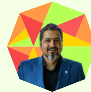
Ricky Kej 3 times Grammy Award Winner & United Nations Goodwill Ambassador