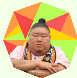
Sh. Temjen Imna Along Hon. Minister of Higher Education & Tourism, Govt. of Nagaland