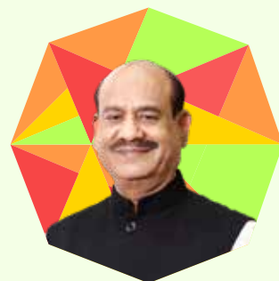
Sh. Om Birla Hon. Speaker, Lok Sabha