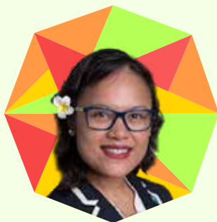
H.E. Ngedikes Olai Uludong Permanent Representative of Palau Islands to United Nations, NY