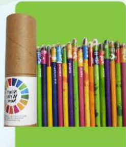
SDG Plantable Pens & Pencils