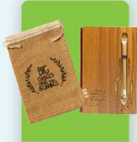
Big Changes Diary Kit