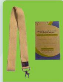
Sustainable Conference ID Card