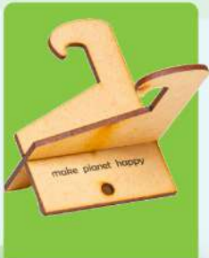
Sustainable Phone Stand