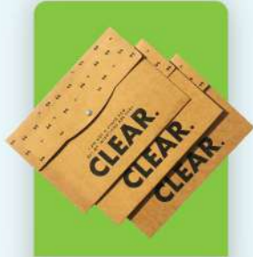
Sustainable Conference Kit File