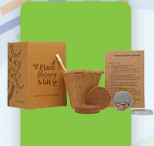
Plant Therapy Kit