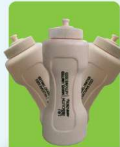
Recycled Plastic Wheat Fibre Bottle