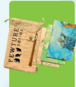
Fewture Series Kit