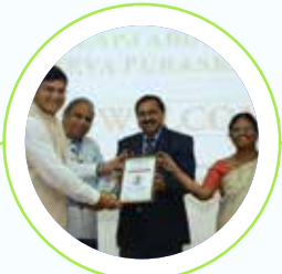
Young Kalam Purashkar in IIT Hyderabad