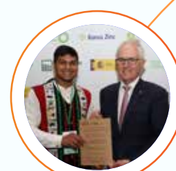
Recognised by the Prime Minister of Australia