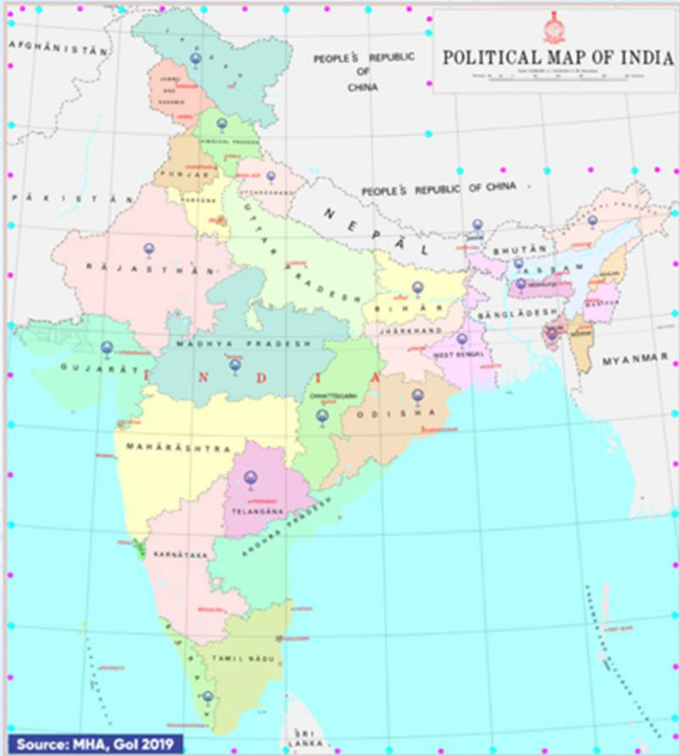
Pinned States represent the region where Youth of India Foundation is active