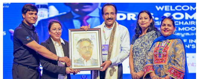
ISRO partners with Youth of India Foundation

1st Gratitude day of Youth of India Foundation celebrated