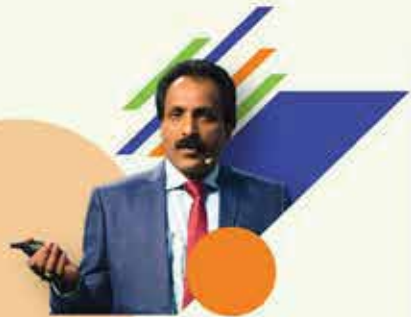
Dr. S. Somanath 10 th Chairman, ISRO

The Youth of India Foundation's commitment to nurturing the nation's youth is commendable. Their initiatives Fostering Education, Leadership, and Skill Development are crucial for our Nation's Progress. I invite Youth of India Foundation members from across the world to witness the Rocket Launch at ISRO's Sriharikota Centre to further Inspire and Engage future generations in the realm of science and technology as envisioned by Hon. Prime Minister of India.