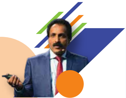
Dr. S. Somanath 10 th Chairman, ISRO

The Youth of India Foundation's commitment to nurturing the nation's youth is commendable. Their initiatives fostering education, leadership, and skill development are crucial for our nation's progress. I invite Youth of India Foundation members from across the world to witness the rocket launch at ISRO's Sriharikota Centre to further inspire and engage future generations in the realm of science and technology as envisioned by Hon. Prime Minister of India.