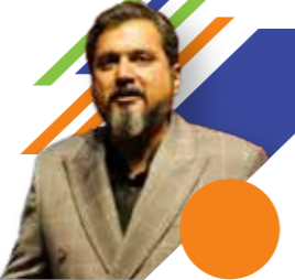
H.E. Rodrigo Alberto Carazo

I have been following the activities being done by Youth of India Foundation and I am glad that time and again, Innovative Initiatives have been organised by the team, especially the UnPlastic India Campaign.